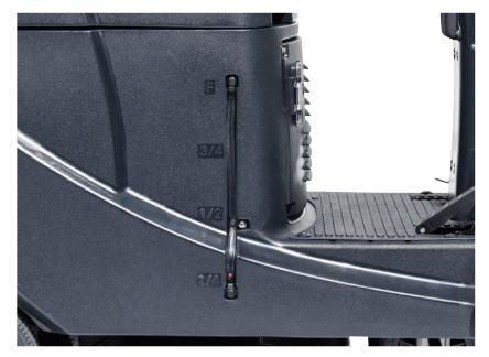
Water solution indicator with volume visible on the