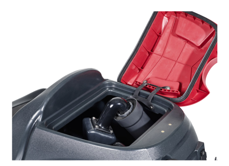
Large opening to the 73 liter recovery tank allows for easy cleaning