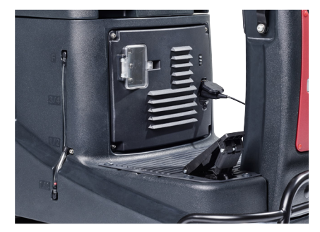
USB-port for fast charging of tablets and cell phones