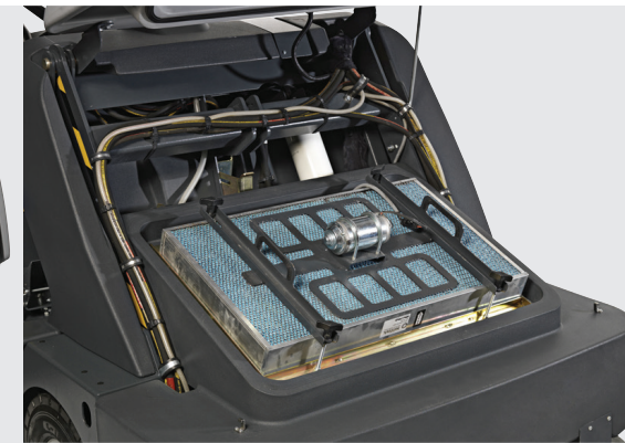
Patent pending Liberator<sup>™</sup> Variable Frequency Filter Shaker System removes dust more effectively from the panel filter, resulting in better air flow and dust control.