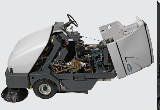
MaxAccess™ allows faster repairs and less downtime so the sweeper spends less time in the shop and more time sweeping.