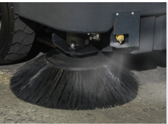
DustGuard™ suppresses airborne fugitive dust where most dust is generated – at the side brooms.

Transportation Facilities Construction Cleanup Indoor and Outdoor Parking Entertainment Facilities