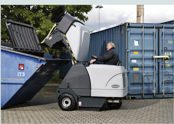
Variable dump height of up to 62 inches allows fast and simple disposal of swept debris.