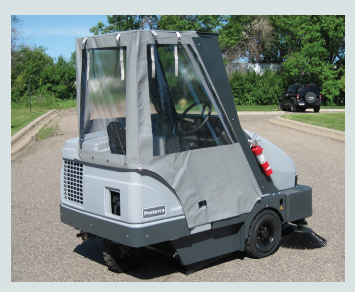
Optional soft sided cab provides increased operator safety and comfort.