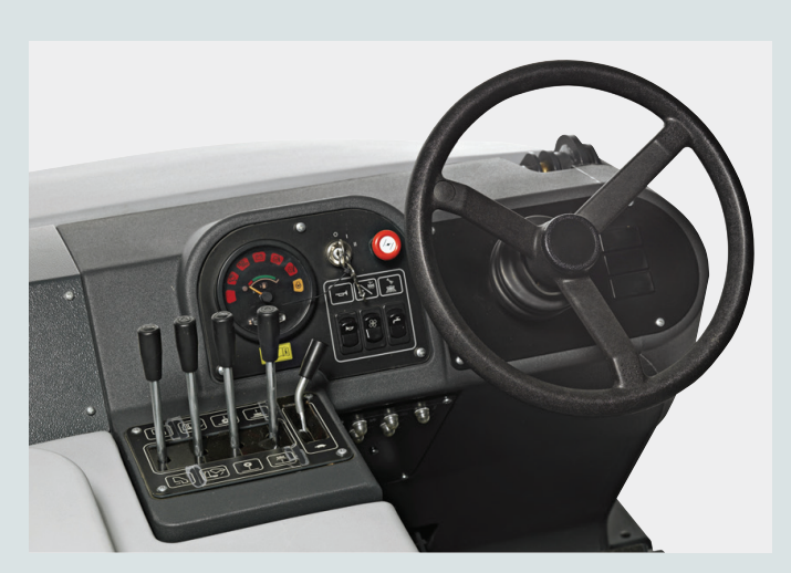
Ergonomic operator interface uses Analog-logic™ which allows a singe operator motion to lower and activate the main broom and side brooms and open the hopper door.