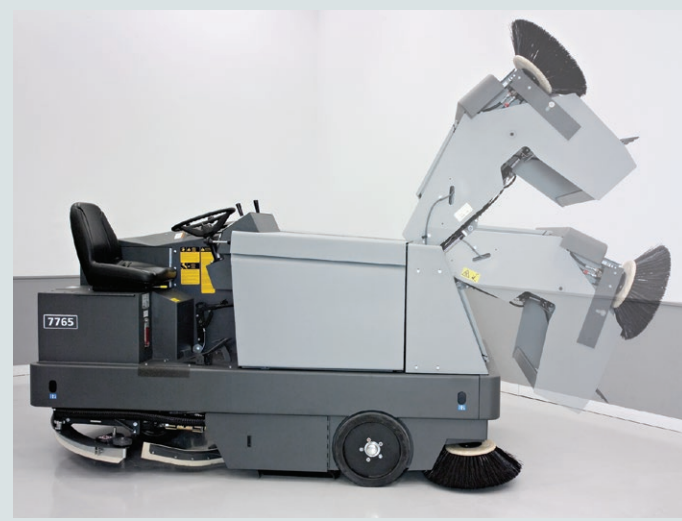
All-steel, 16 cubic foot debris hopper has a variable 60 inch dump system.