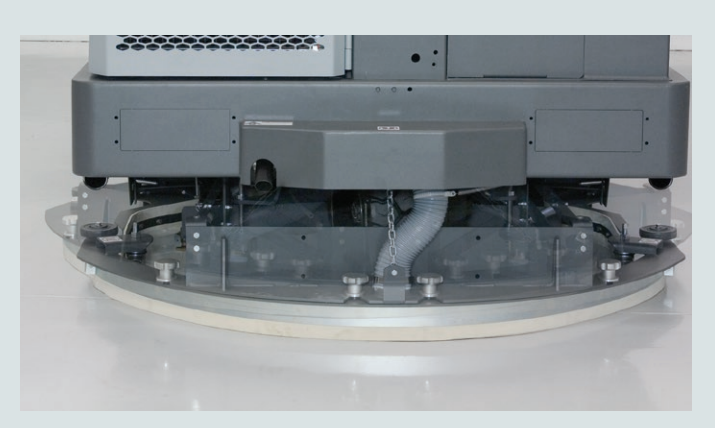
Patented Accu-Track™ squeegee provides superior water pick-up even during the tightest turns.