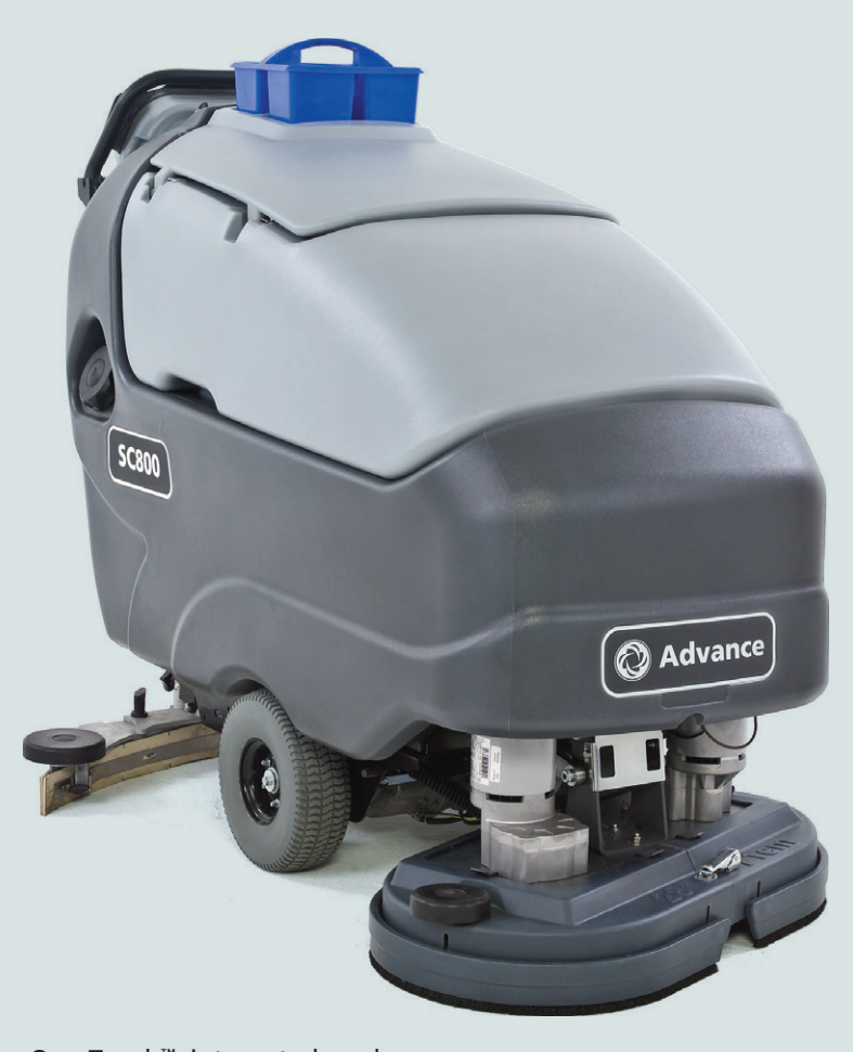
One-Touch™, integrated scrub pressure and solution flow rate settings:

Advance's rugged, low-maintenance SC750™ and SC800™ scrubbers deliver incredible value on a walk-behind platform. High productivity per tankful allows for 84 minutes of continuous scrubbing, which reduces dump/refill cycles and helps provide fast ROI. The optional EcoFlex™ System offers the flexibility to clean across the entire cleaning spectrum from green to clean. At the touch of a button one can switch from chemical free cleaning to using an ultra low dilution ratio, and of course detergent can be used at full strength for the toughest of soils. The burst of power feature lets you easily apply more pressure, more solution and more detergent at the touch of a single button. With the flexibility to easily apply the right scrubbing performance for the job, you'll use less detergent, minimize water use and save on cleaning costs.