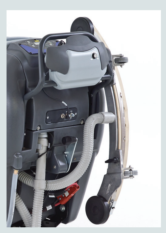
A built-in squeegee hanger makes transport easier and reduces trip and fall accidents.