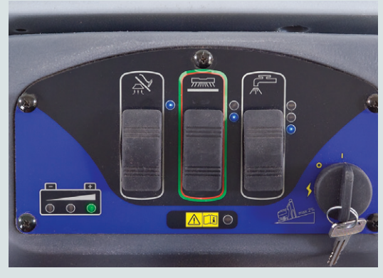
The ST 26 inch disc model – provides simple operation and robust scrubbing controls.