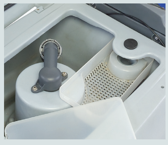
An integrated debris catch cage traps and collects drain clogging debris.