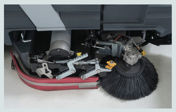
The off-set deck provides high quality edge cleaning without any added complexity or cost.