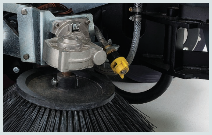
DustGuard™ minimizes side broom fugitive dust generation and provides optimal sweeping performance. (optional)