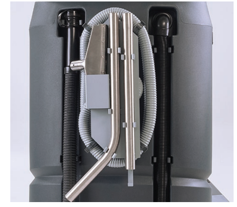
Wet vacuuming in more confined areas. (optional)