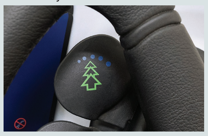
Flexible cleaning solution with intuitive modes of operation. (optional)