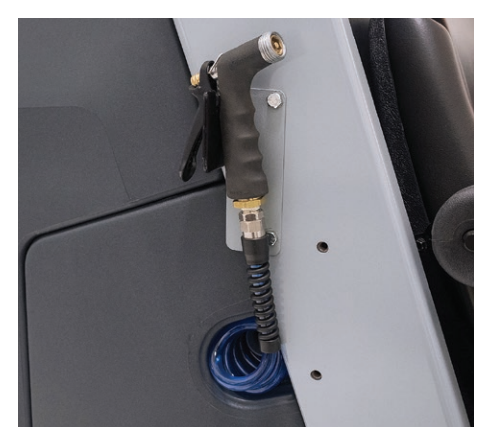
Apply solution to the floor in conjunction with vac wand, or used for machine cleaning. (optional)