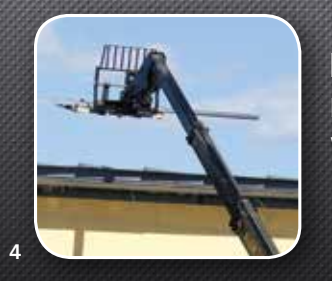
Fine Boom Control Place loads at height with confidence.