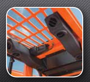
Optional Air Conditioning Stay cool on hot days and work in air conditioned comfort.