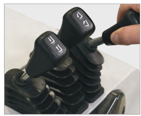
Optional auxiliary lever also shown.

The ergonomic layout of the control head includes our thumb-operated rotary controls , which can be accessed from either side to easily adjust direction and speed. Our "Soft Touch" switches also allow easy lifting or lowering of loads.